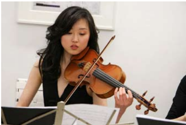
Rhee Chamber Ensemble