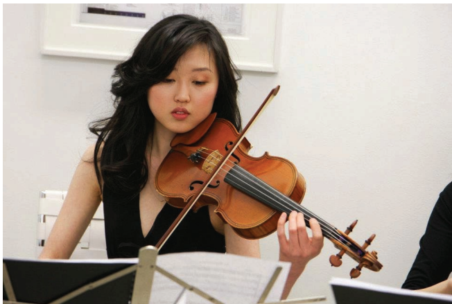
Rhee Chamber Ensemble